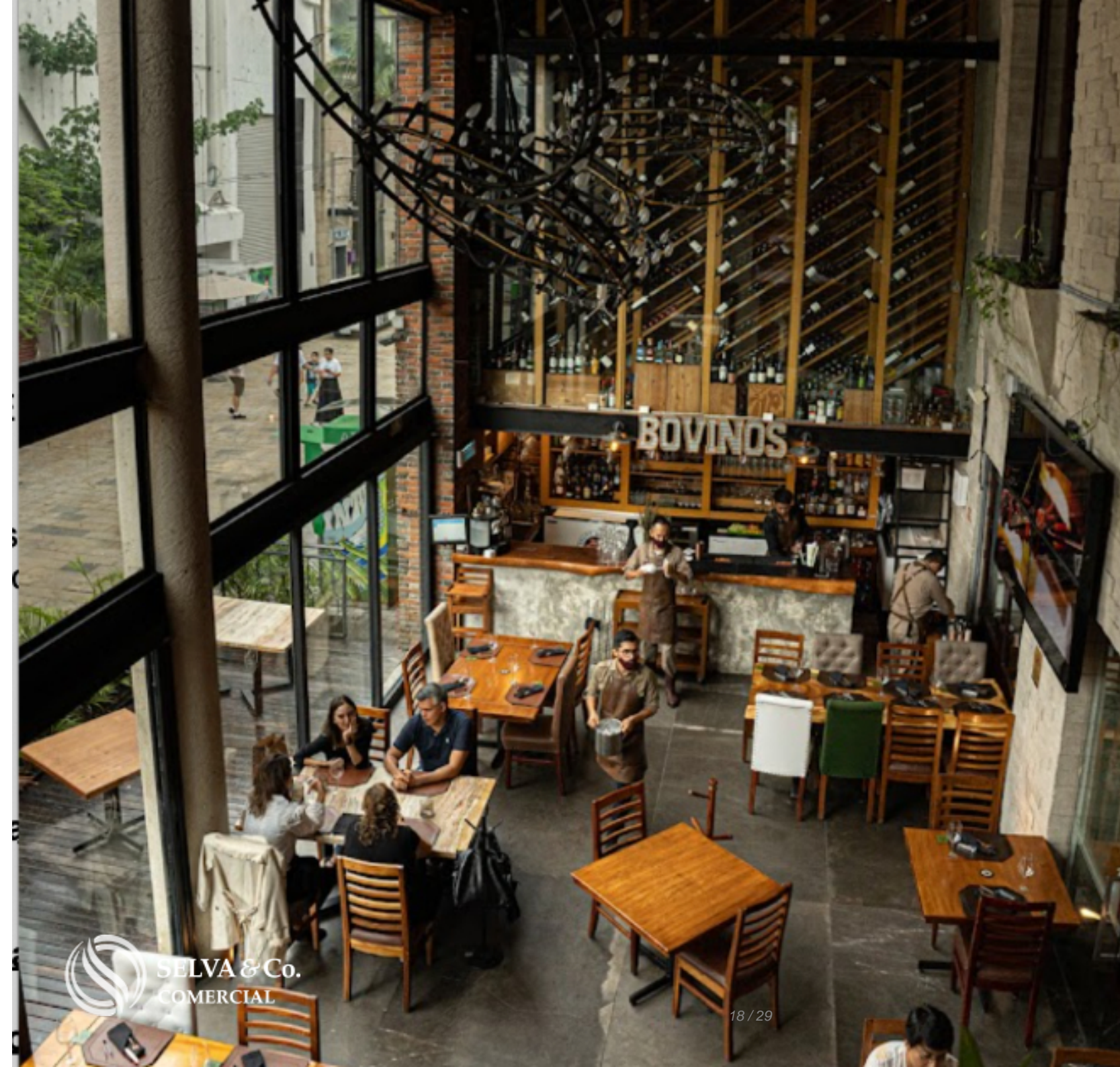
Restaurante Bovinos Bovinos Restaurant