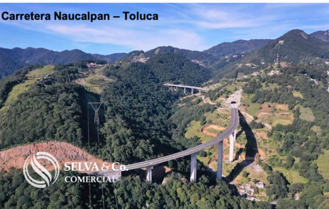
Carretera Naucalpan – Toluca