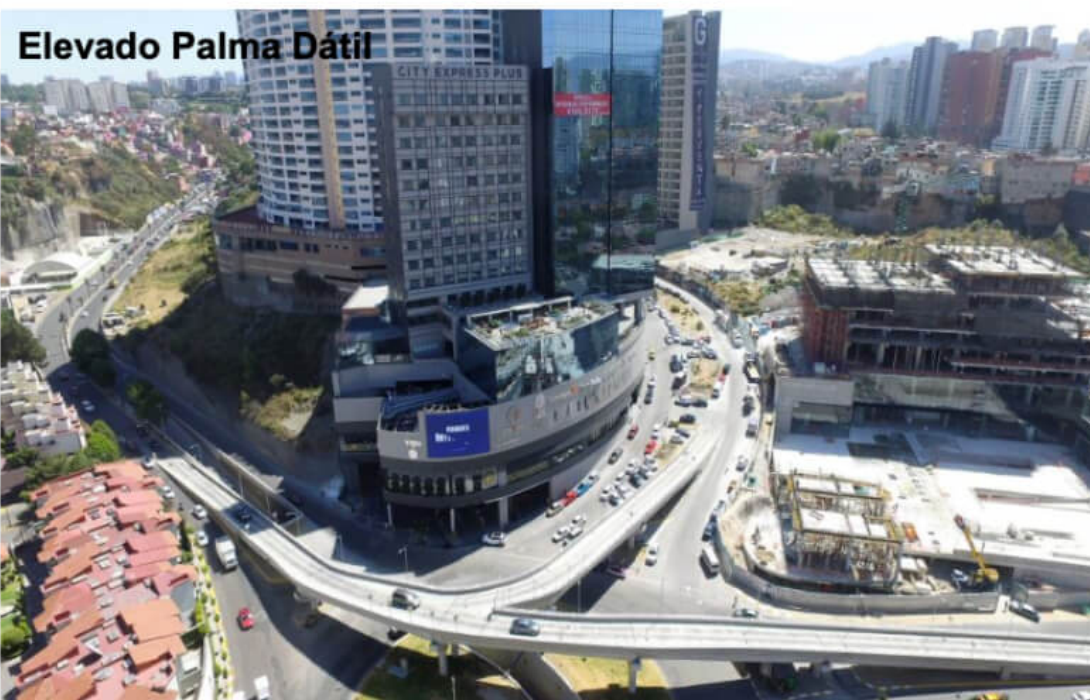
Elevado Palma Dátil