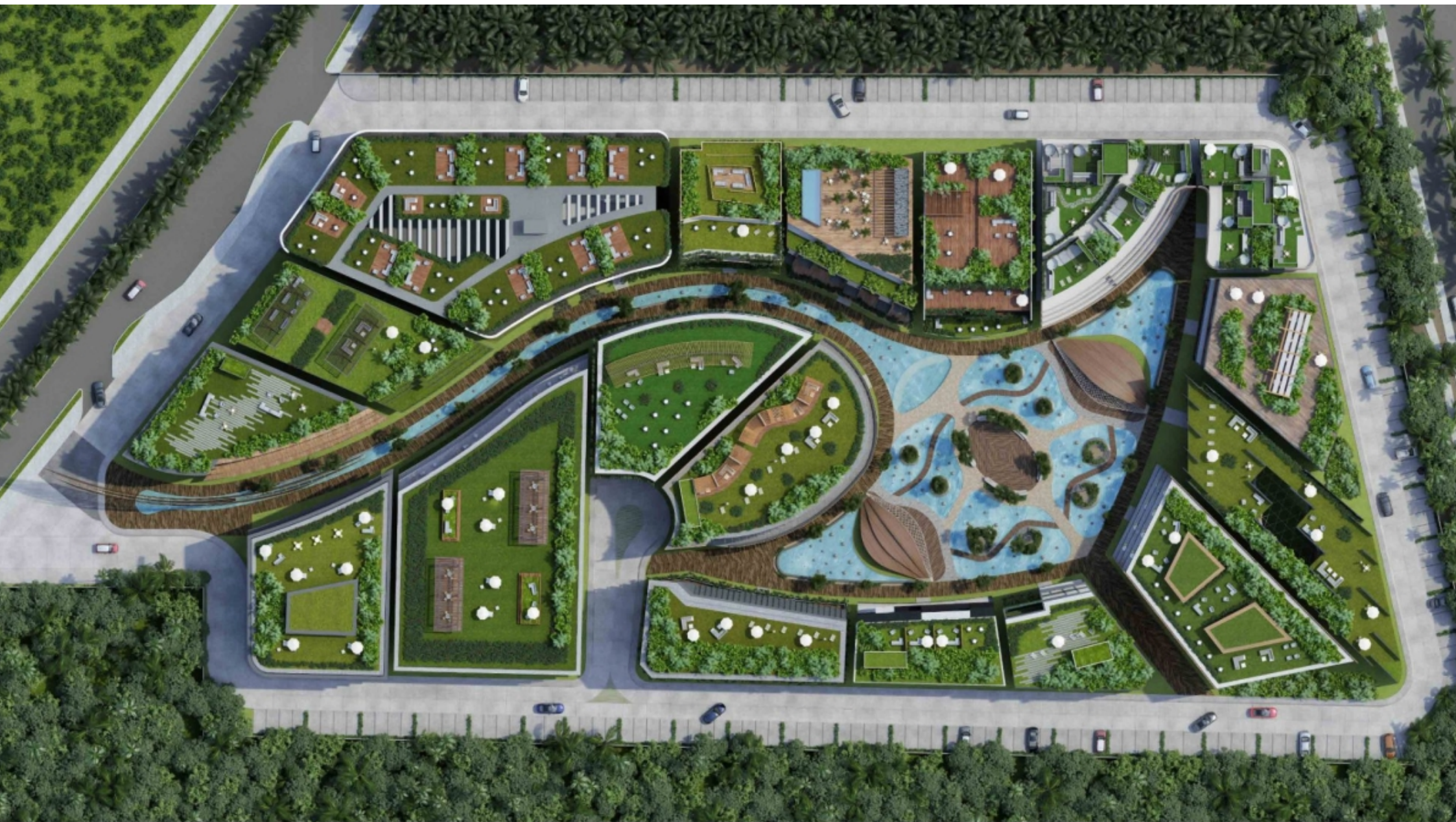
Vista aerea de la comunidad - Aereal view of the community