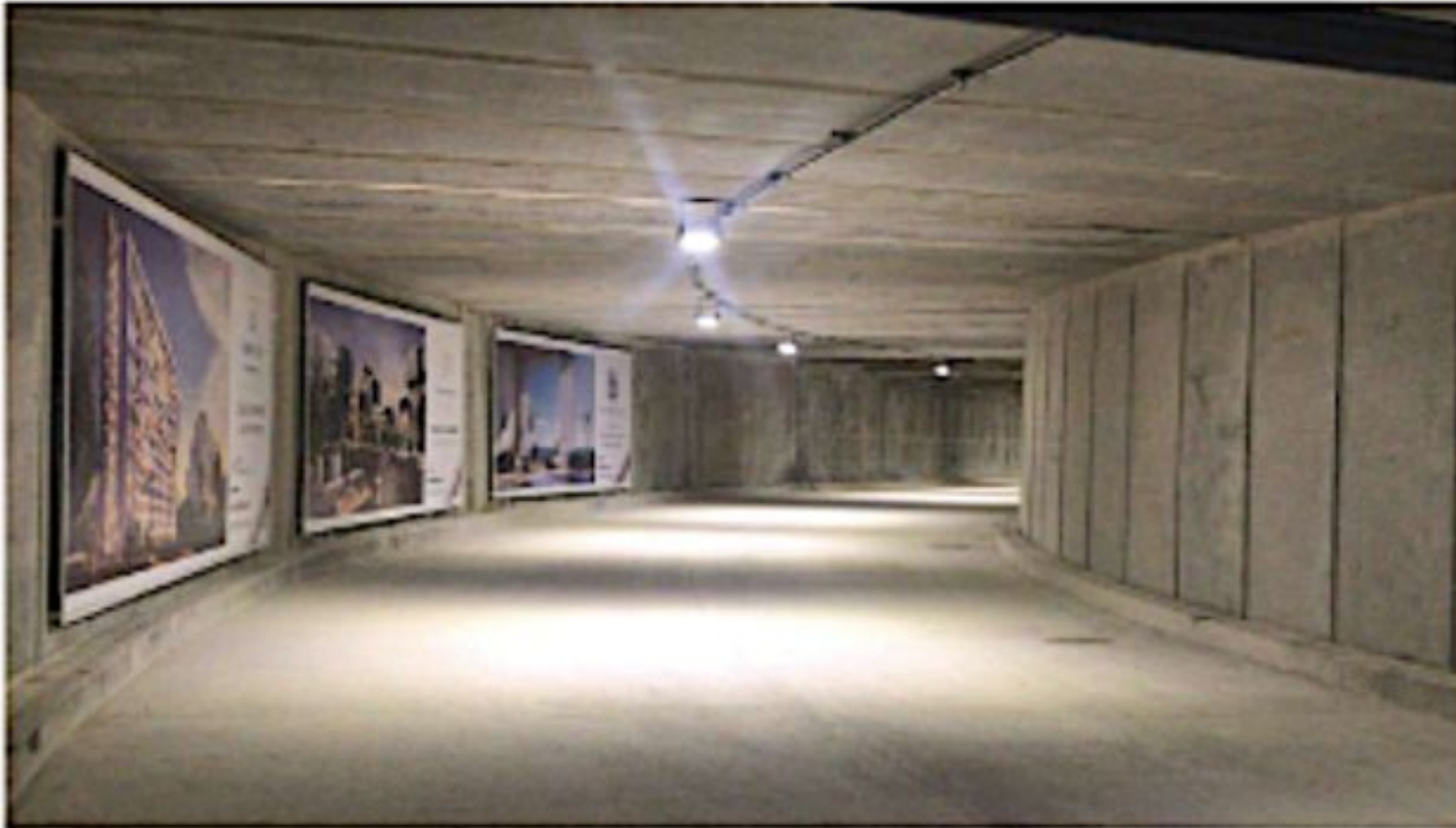
Tunel subterraneo Underground tunnel