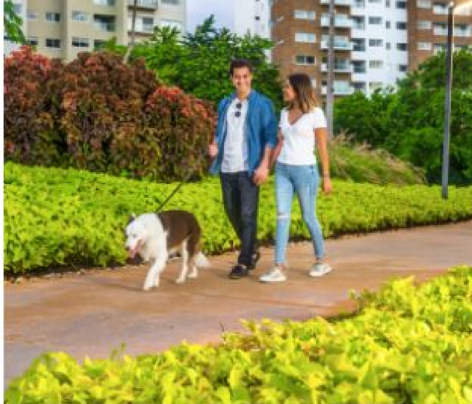
Areas verdes Green areas