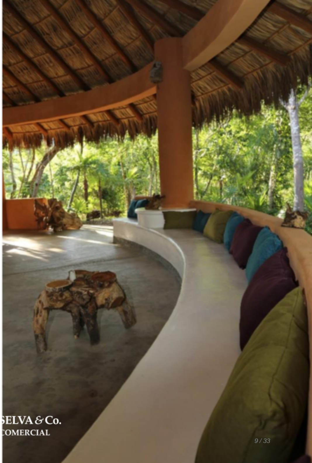
Interior de la palapa central Interior of main terrace with palapa