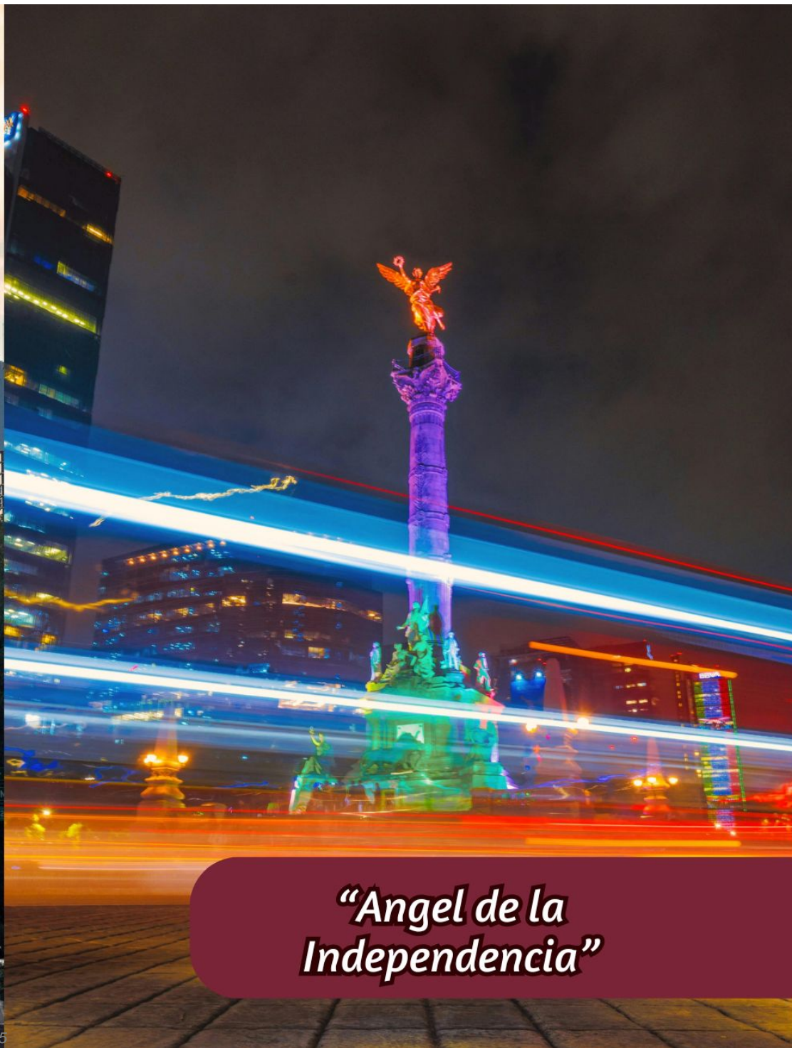
“Angel de la Independencia”