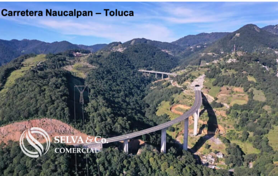
Carretera Naucalpan – Toluca