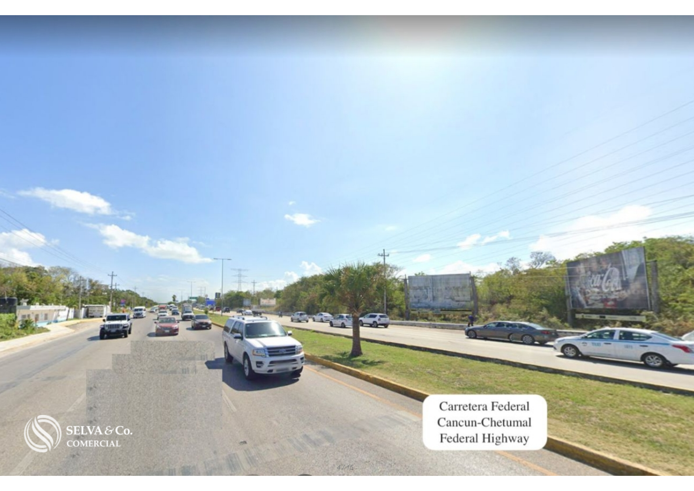
Carretera Federal Cancun-Chetumal Federal Highway